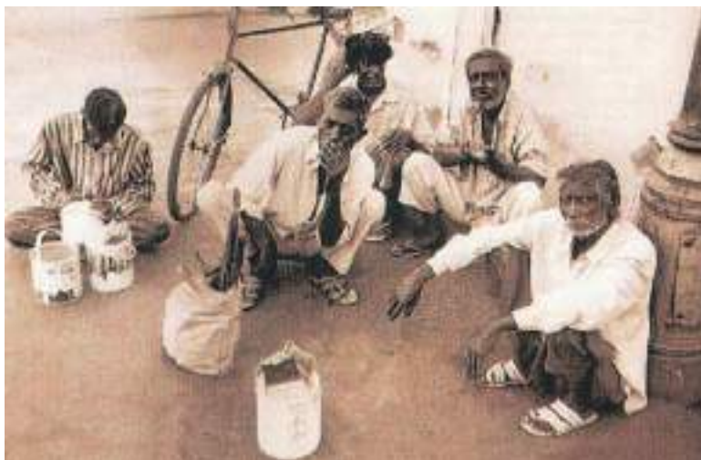
At labour chowk, daily wage workers wait with their tools for people to come and take them for work.

construction sites, lift loads or unload trucks in the market, dig pipelines and telephone cables and also build roads. There are thousands of such casual workers in the city.