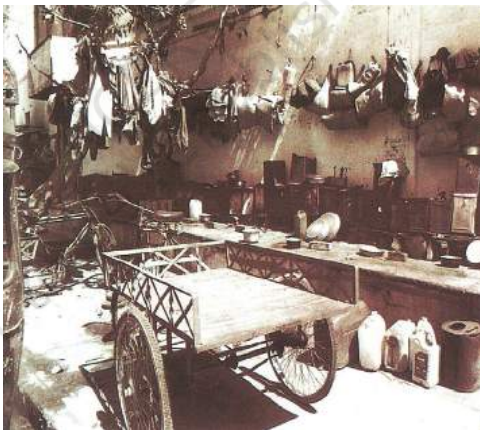
Often workers who make a living in the city are forced to set up their homes on the street as well. Below is a space where several workers leave their belongings during the day and cook their meals at night.

Vendors sell things that are often prepared at home by their families who purchase, clean, sort and make them ready to sell. For example, those who sell food or snacks on the street, prepare most of these at home.